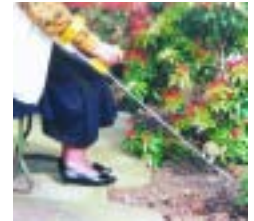
PR70053 Interchangeable Arm Support Cuff