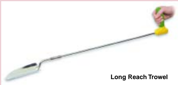
Long Reach Trowel