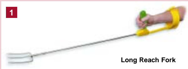
Long Reach Fork