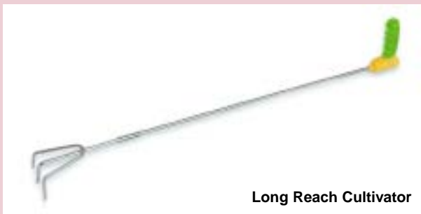
Long Reach Cultivator